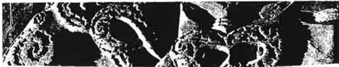
Fig. 100a. Two figures, 54 cm, of the series of thirteen carved on the side-wall panel of the pataka Te Oha (fig. 99).