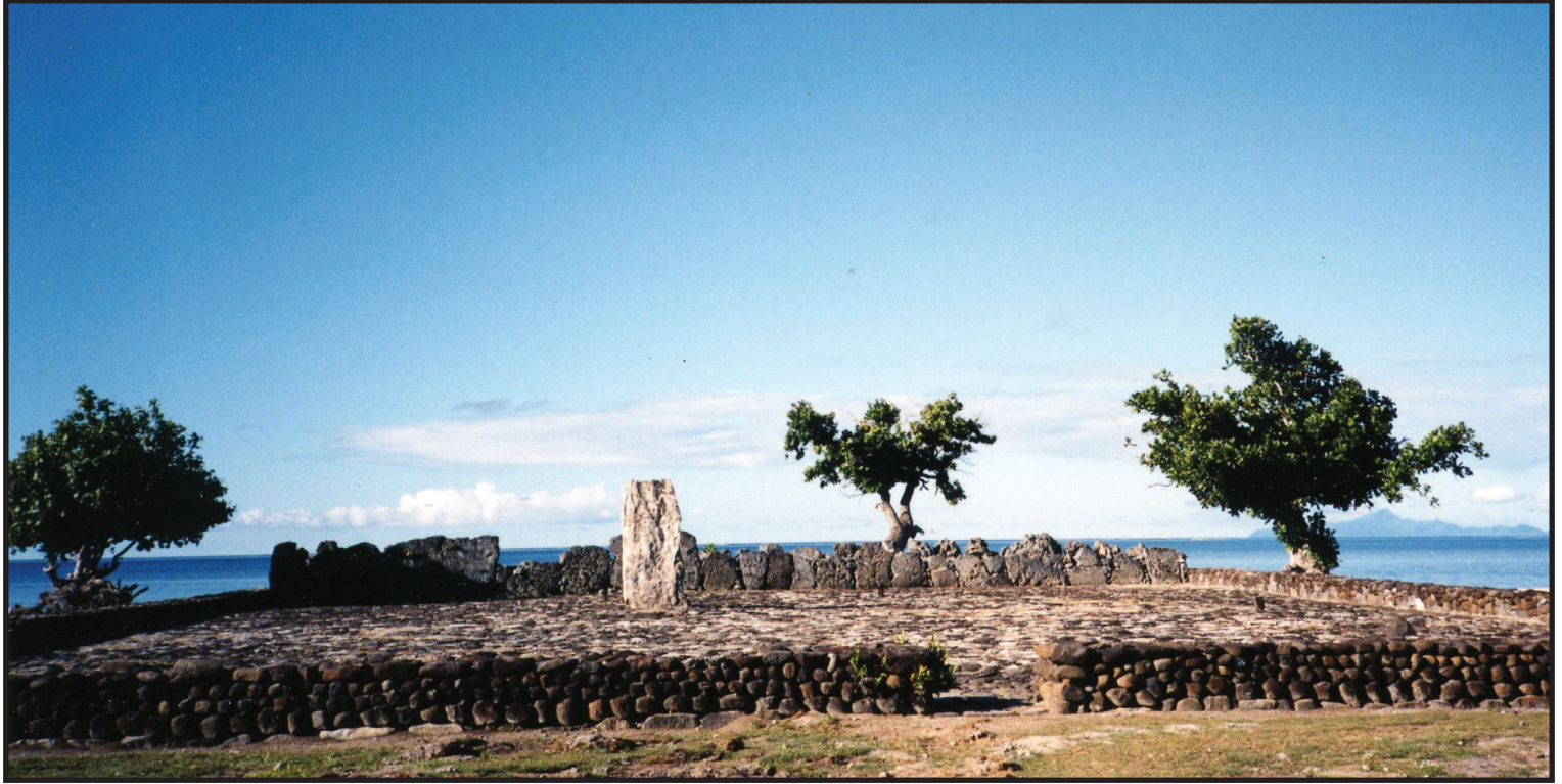
Taputapuātea, an ancient marae constructed of stone on Raiatea in the Society Islands, restored in 1994.