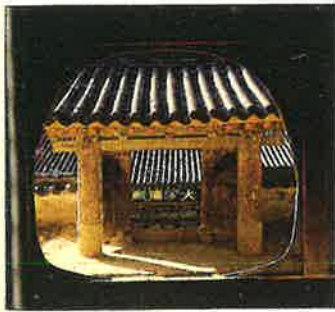
The entrance to the library where the Tripitaka Koreana wood blocks are kept.

Another path leads from behind the main hall of Haeinsa Temple to Paengnyŏnam Hermitage, about 1 kilometer southeast of the temple. It is a small temple where many Zen meditators sit year-round. Down the slope from this hermitage are two other hermitages Kugilam and Yaksaam. Both are residences and study halls for nuns; the former for the Zen education of nuns, and the latter for girls aspiring to become nuns. High Priest Yujŏng (Samyŏngdang), who commanded a contingent of militant monks during Hideyoshi's invasion of Korea, died in Kugilam Hermitage in 1610. His memorial stone statue, which the local Japanese police destroyed in the 1940s, was reassembled and erected alongside a stream beside the hermitage.