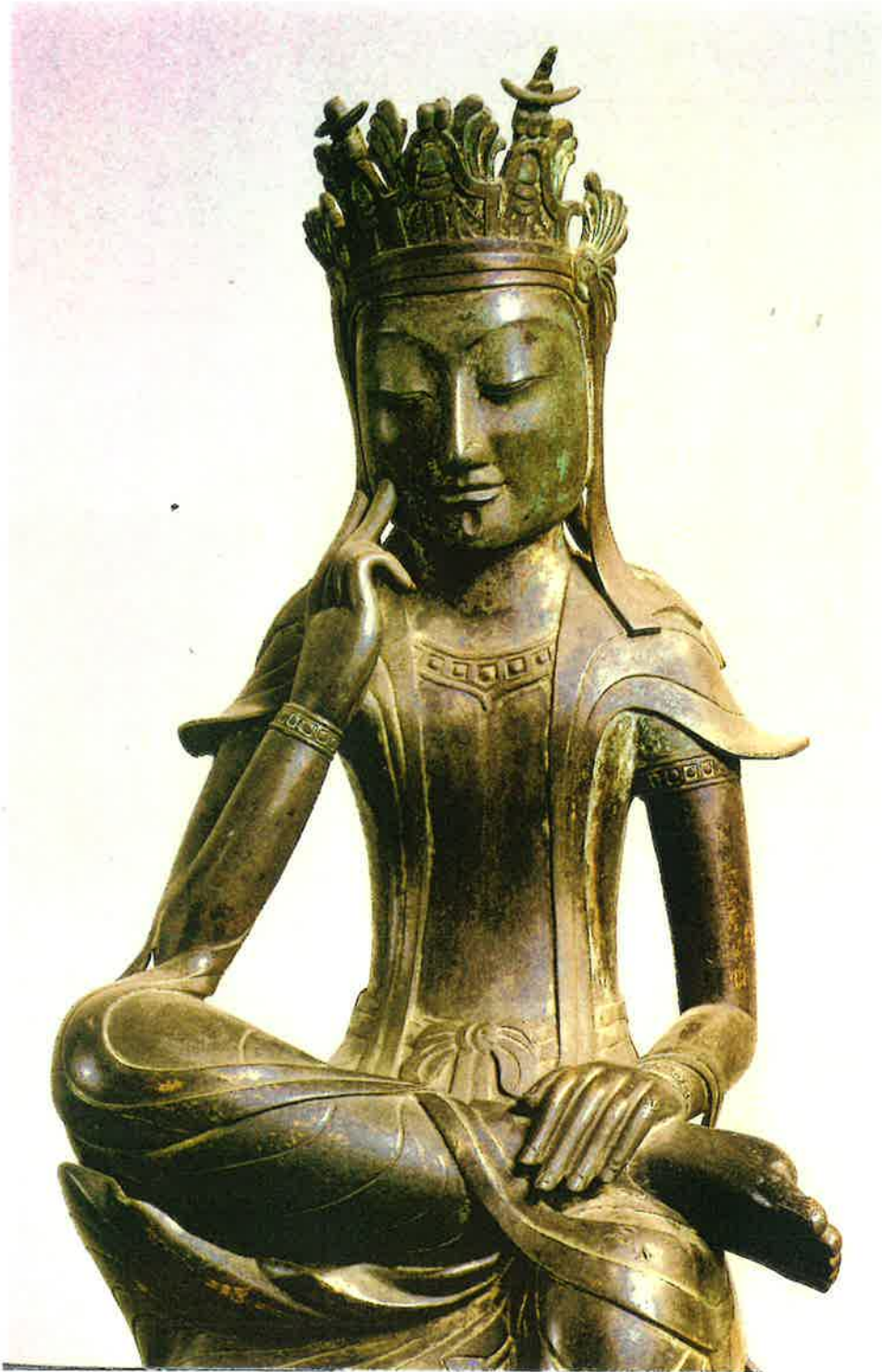
Gold crown ornaments (below) excavated from the tomb of Paekche's King Muryōng-wang (r. 501-523). A gilt-bronze Maitreya Buddha of the Three Kingdoms era, late 6th century (right).