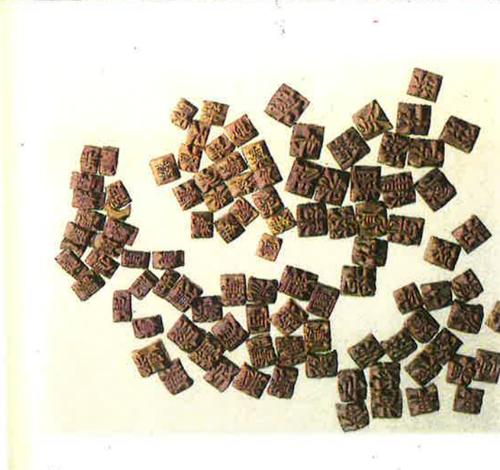
The wood blocks used to print the Tripitaka Koreana, carved between 1237 and 1252 (above), are preserved in ideal conditions in a naturally ventilated storehouse (opposite) at Haeinsa Temple. Movable metal type, one of the greatest inventions of the Koryŏ people.