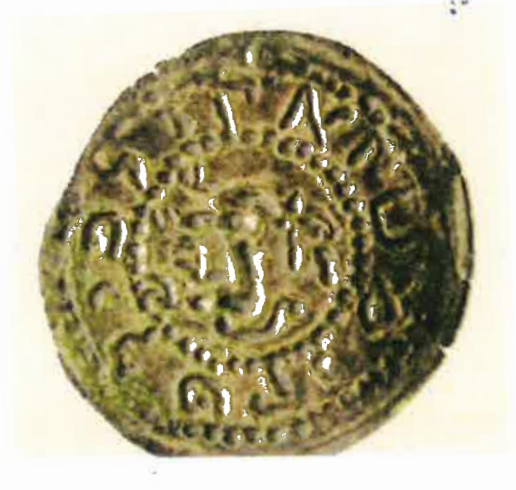
Early Polish coin with Hebrew inscriptions.