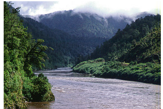
Buller River near Berlins