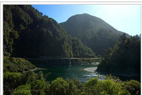
The Buller River

The Buller has several major tributaries. These include (in order from Lake Rotoiti) the Gowan River, the Matakitaki River, the Maruia River, and the Inangahua River. Other smaller tributaries include the Hope, Owen, Mangles, Matiri,