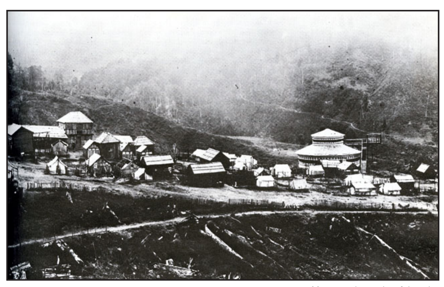
Maungapohatu, city of the mist.