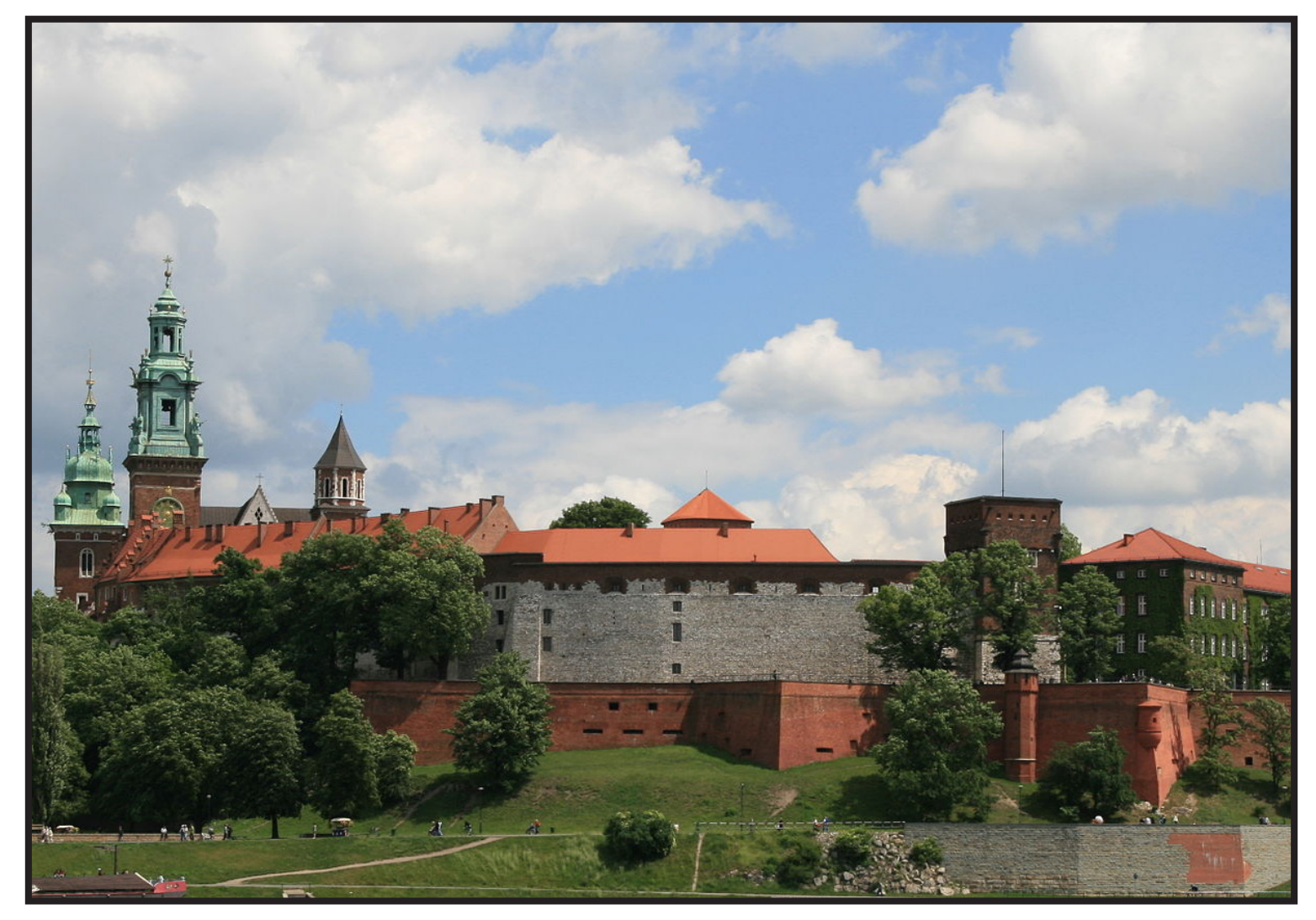
Wawel Castle in Kraków