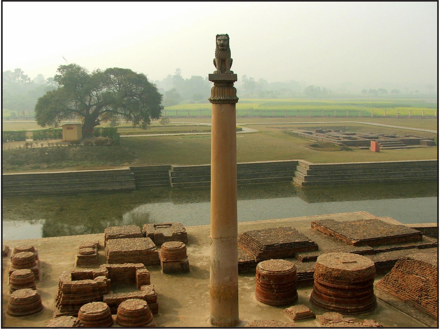
View of the Pillar at Vaishali, which does not bear an Ashokan Edict.